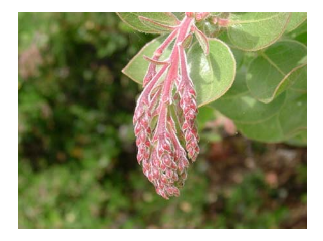
Artctostaphylos glauca (Bigberry Manzanita) in bud near Pelican Harbor on Santa Cruz Island