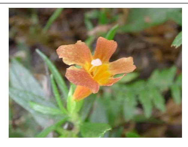
Mimulus flemingii X M. aurantiacus? Island Monkeyflower hybrid near Pelican Bay, Santa Cruz Island.