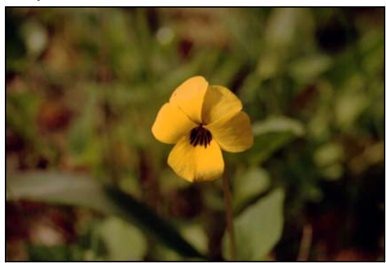
Viola pedunculata spp. pedunculata (Johnny-Jump-Up)

My favorite plant of the season is Viola pedunculata ssp. pedunculata (Johnny-Jump-Up), which is a perennial herb in the Violet Family (Violaceae). This puberulent plant comes from a deep rhizome with cauline, triangular-shaped leaves and orange-yellow petals baring reddish-brown markings. Johnny-Jump-Ups can be discovered in open, undisturbed, grassy hillsides growing amongst Wildflower Field or Oak Woodland habitats. I grow violets at home, but nothing compares to the delicate nature of these little beauties, and the pristine habitat they usually occur in.